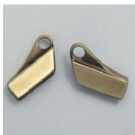
E0134 O - N - OV