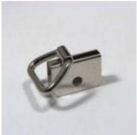
82570/20 O - N - OV