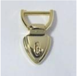
82155/20 O - N