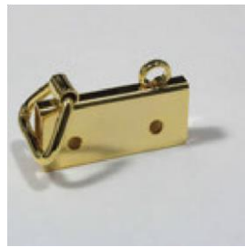
81203/20 O - N - OV