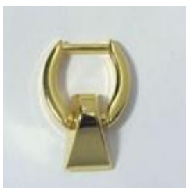
82339/15 O - N