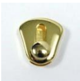
81850 O - N