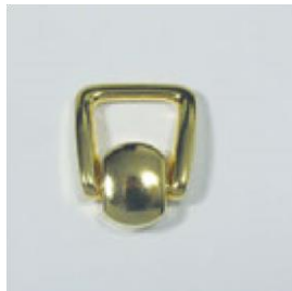
81739/15 O - N