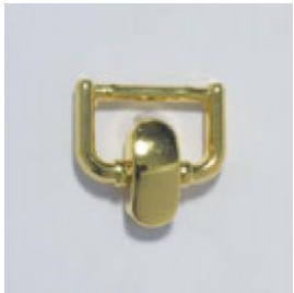
81567/20 O - N