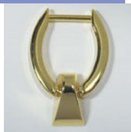
82327/20 O - N