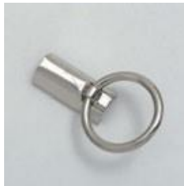
12341 O - N