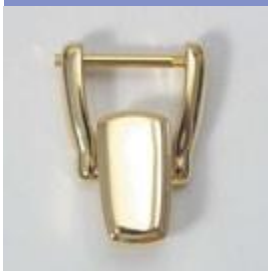
82116/20 O - N