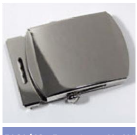
F161/40 - Ferro Iron N -AV F161/30 - Ferro Iron N -AV