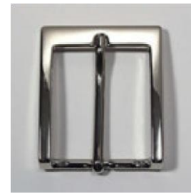
722/35 O - N