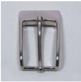
819/30 O - N