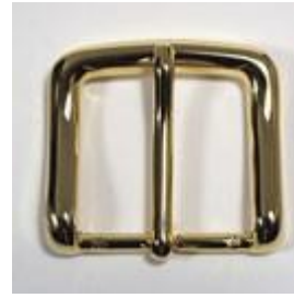
573/40 O - N - OS - NS