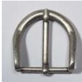
3640/40 OV - AV - NS-