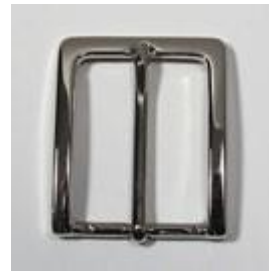
707/35 O - N