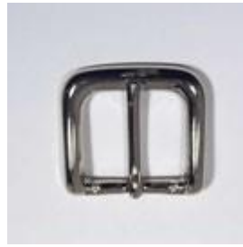
502/30 O - N - OS