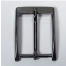
8713/35 O - N - B