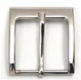
VA00351/40 O - N