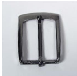
8027/30 O - N - B