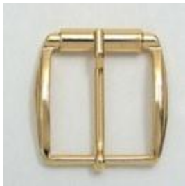
8717/35 O - OV