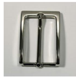
933/30 O - N