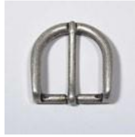
551/30 N - OS - AV