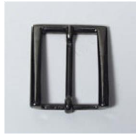
7873/30 O - N - B