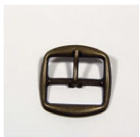
11838/20-25 O - N - B