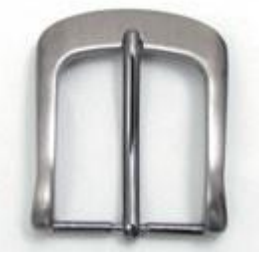
R059586/35 NN - NS