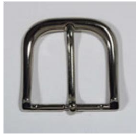
1651/40 O - N