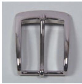
862/35 N - AV - OS - NS