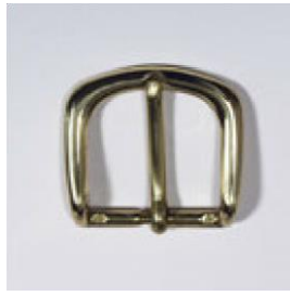
540/30 N - OS