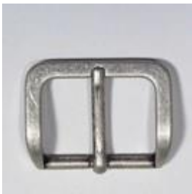
661/4 OS - AV