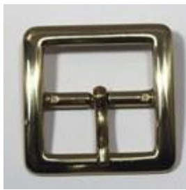
704/30 O - N - NS