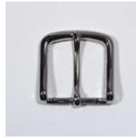
509/30 O - N - AV - NS