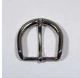
1351/30 O - N

O = Oro/Gold N = Nichel/Nickel B = Bronzo/Bronze OV = Ottone Vecchio/Old Brass AV= Argento Vecchio/Old Silver OS = Ottone Satinato/Glazed Brass NS = Nichel Satinato/Glazed Nickel