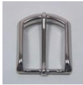
917/35 O - N