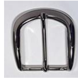
582/40 O - N - OS - NS