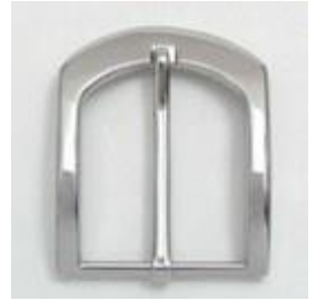
VA00350/35 O - N