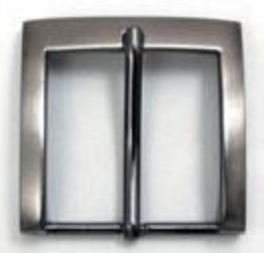
R059775/40 NN - NS