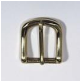
521/25 N - OS

O = Oro/Gold N = Nichel/Nickel B = Bronzo/Bronze OV = Ottone Vecchio/Old Brass AV= Argento Vecchio/Old Silver OS = Ottone Satinato/Glazed Brass NS = Nichel Satinato/Glazed Nickel