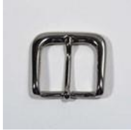
1647/30 O - N