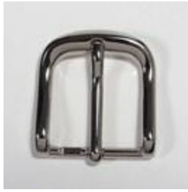
569/35 N - OS - NS