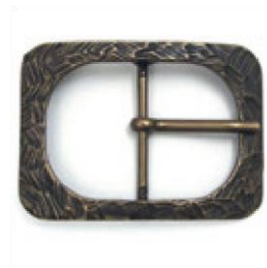
N3706/50 O - N - OV