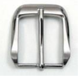
R0597115/35 NN NN R0597118/35 NN - NS - NS