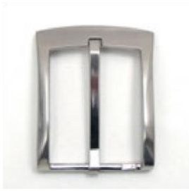
VA00137/35 O - N - NS

O = Oro/Gold N = Nichel/Nickel B = Bronzo/Bronze OV = Ottone Vecchio/Old Brass AV = Argento Vecchio/Old Silver OS = Ottone Satinato/Glazed Brass NS = Nichel Satinato/Glazed Nickel NN = Nichel Nero/Black Nickel