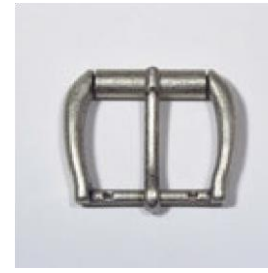
613RL/30 N - OS - AV