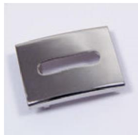
10173/40 - Ferro Iron N