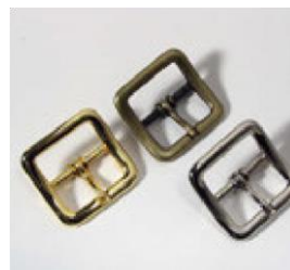
16641/20 O - N - OV 16640/25 O