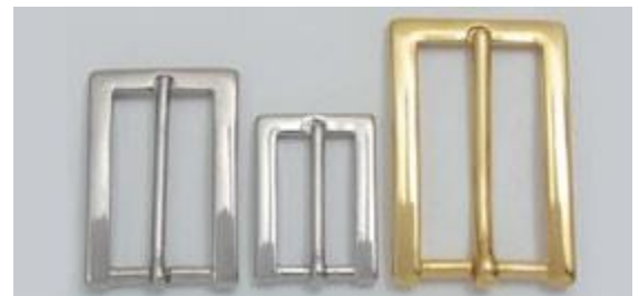
82416/15-20-25 O - N