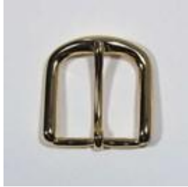
1648/30 O - N