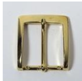
1995/35 O - N