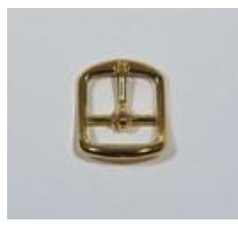
18237/13 O - N - OV