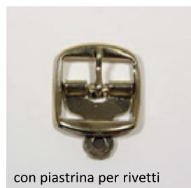
con piastrina per rivetti