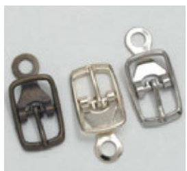
1-5500/8-10 O - N - OV