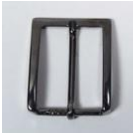
8026/35 O - N - B Bc