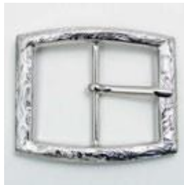
3704/55 O - N - OV