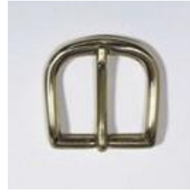
564/30 N - OS