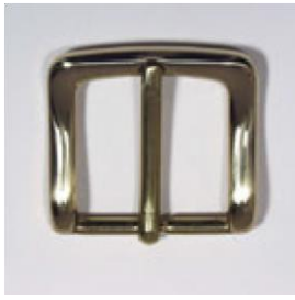
580/35 O - N - OS - NS