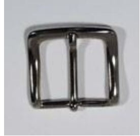
1649/35 O - N