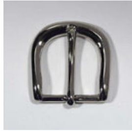
3196/30 O - N - OV