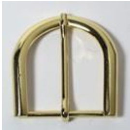
089/40 - 60 O - N