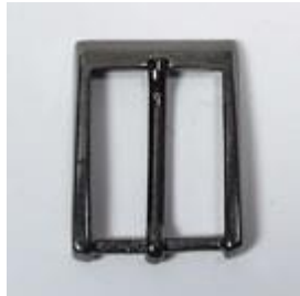
7874/30 O - N - B