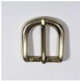
538/25 N - OS