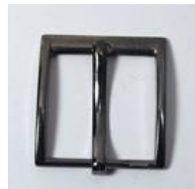
10946/40 O - N - B - AV