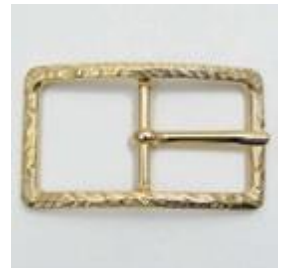
3708/40 O - N - OV