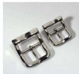
82122/15-20 O - N