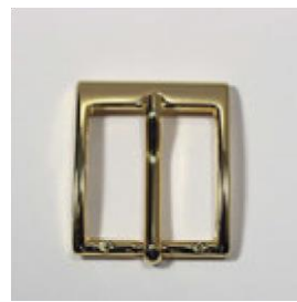
766/30 O - N