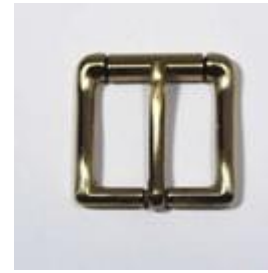
NS525RL/30 - AV - OS - NS