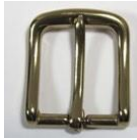
571/40 N - OS - AV - NS